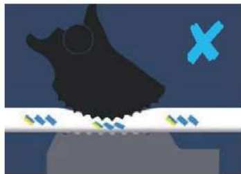
Instead of just jamming the rope...